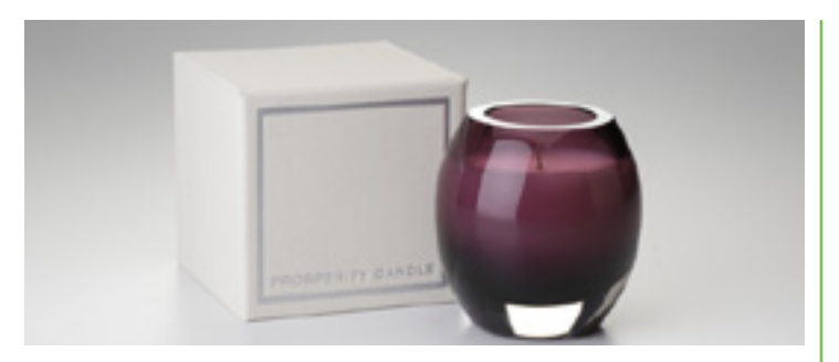
Prosperity Candle<sup>SM</sup> Brilliance Candle

The Brilliance Candle is made by adult, female artisans who are paid fairly and respected at their workplace. Prosperity Candle<sup>SM</sup> is certified by the B Lab and a part of the World Fair Trade Organization.