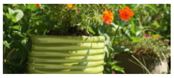
Ten Thousand Villages<sup>SM</sup> Green Hills Planter The Green Hills Planter is a handcrafted ceramic pot from Vietnam. Like all the other fair trade items from Ten Thousand Villages<sup>SM</sup>, this product was made without forced or child labor.