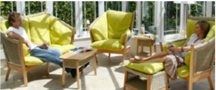
The Fair Trade Furniture Company Semarang Chair By purchasing the Semarang Chair from The Fair Trade Furniture Company, you are supporting the ability of slavery-free suppliers to continue supporting the craft of adult artisans.