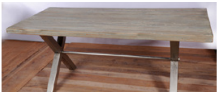
Worldstock Fair Trade Dining Table Worldstock Fair Trade is a store within Overstock.com<sup>SM</sup> that features fair trade, handmade items from artisans around the globe.

SERRV International<sup>SM</sup> Heirloom Acacia